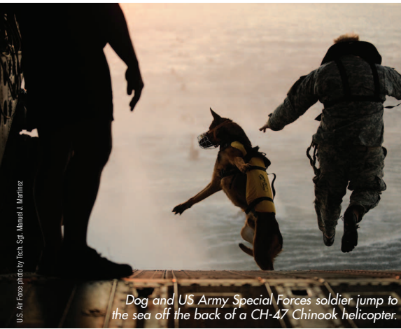
Dog and US Army Special Forces soldier jump to the sea off the back of a CH-47 Chinook helicopter.

The Purr'n Pooch Foundation for Animals is a volunteer-run, grant-making organization dedicated to providing financial support and educational resources to animal rescue groups and organizations across the United States. The foundation supports all species of animals and is a registered 501 (c)(3) non-profit organization.