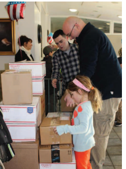
Preparing boxes for shipment